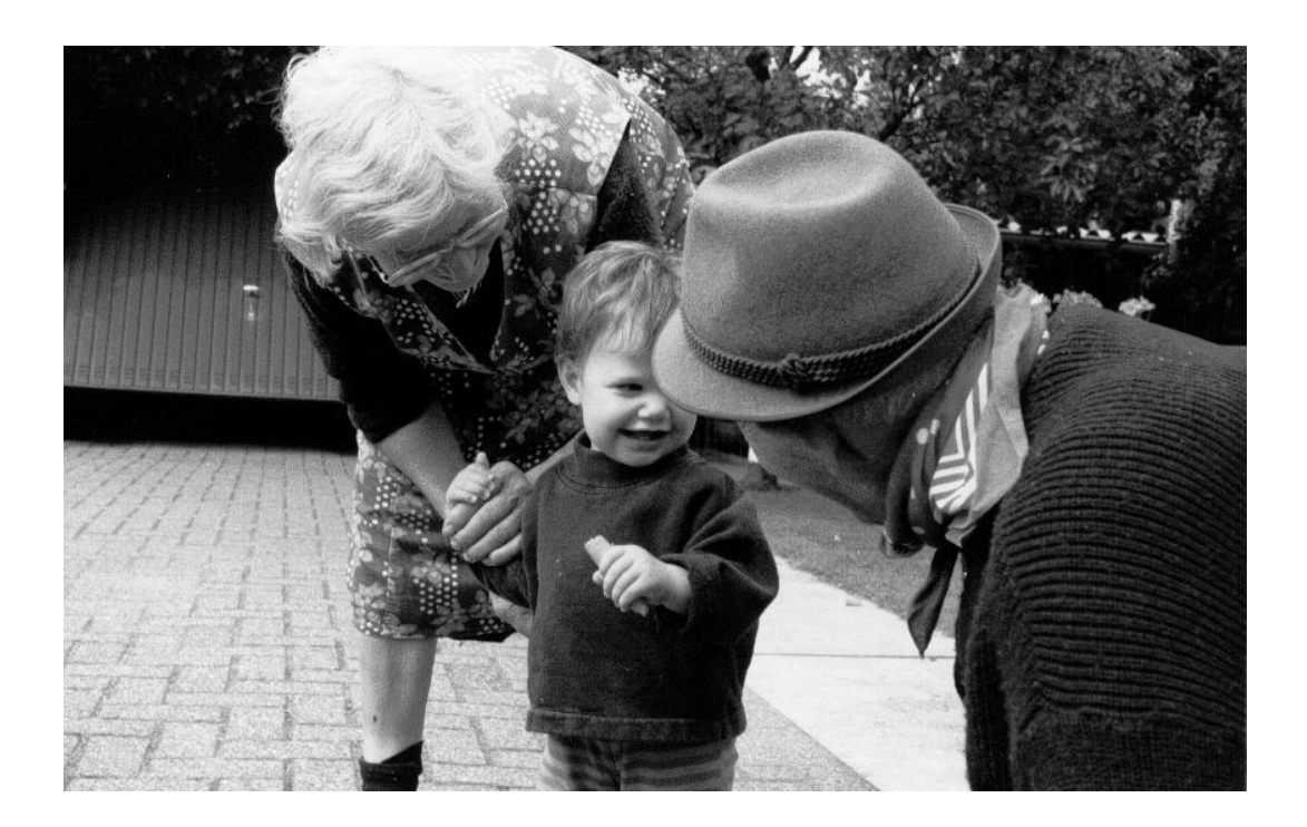
Figure 7.2: From the viewpoint of a social approach to learning, interaction between learners and mediators is absolutely crucial, particularly for the acquisition of language. (mw)

guists and philosophers. In linguistics, the position is known as the Sapir-Whorf thesis. It is based on evidence that different languages in the world not only use different word forms and syntactic constructions but that the conceptualisations underlying language are profoundly different as well [34]. Language acquisition therefore is believed to go hand in hand with concept acquisition [3]. Moreover language-specific conceptualisations change over time in a cultural evolution process, which in turn causes grammatical evolution that may induce further conceptual change [18].