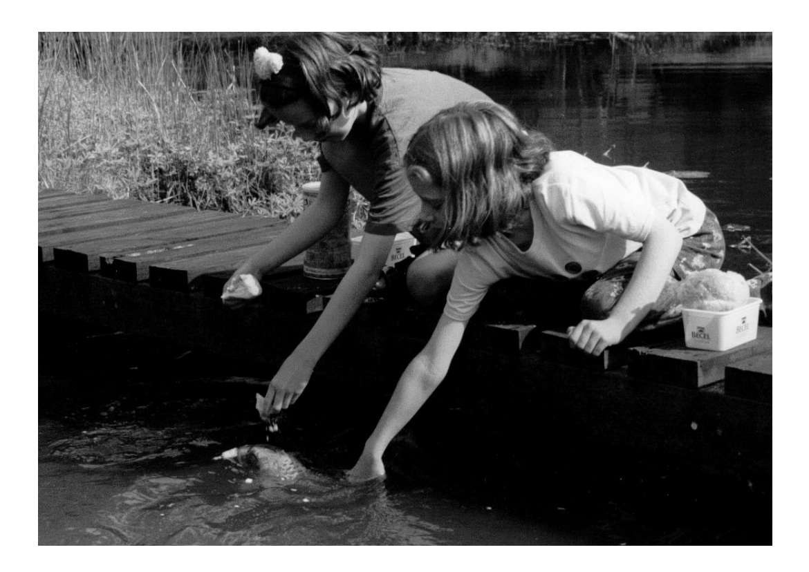
Figure 7.1: Children can solve problems through social interactions which none of them can solve individually. Interacting together with the physical world is part of play. It is as necessary and insightful as instructional learning. (mw)

I call it the labelling theory because the language learner is assumed to associate labels with existing categories.