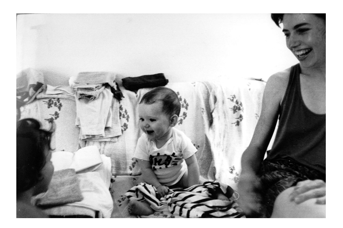
Figure 7.4: Language games rest on a rich substrate of competences concerned with turntaking, face identification, and sharing attention. These are acquired through play in the first years of life.