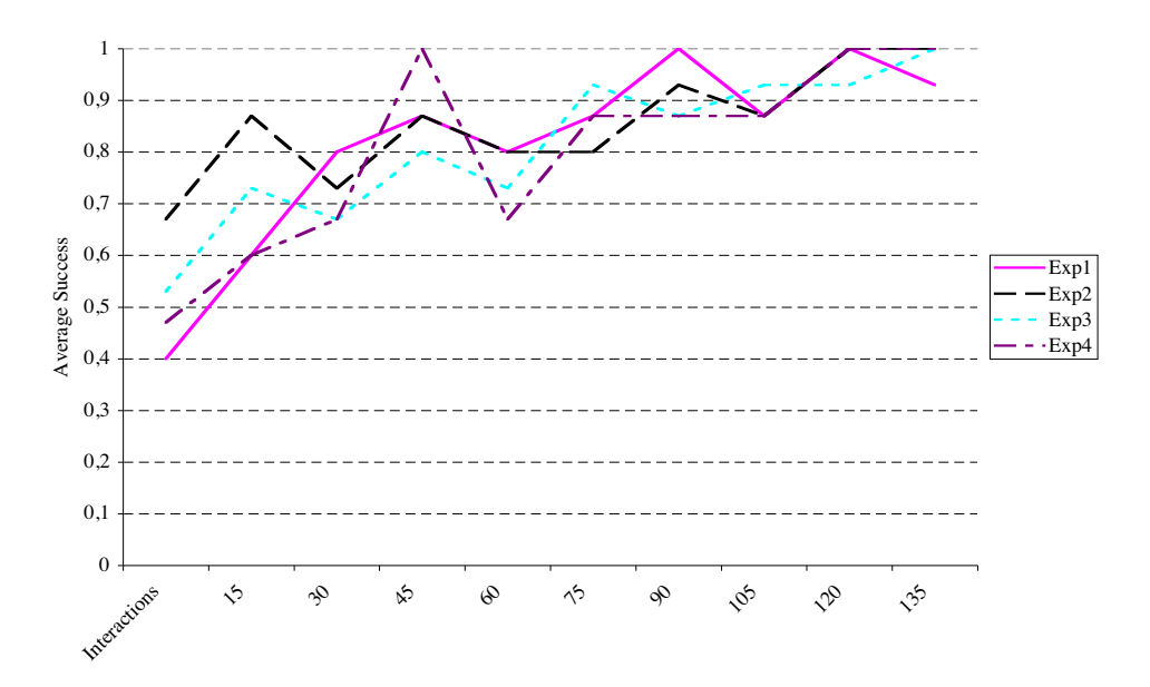
Figure 7.7: Evolution of the classification success for four different training sessions.