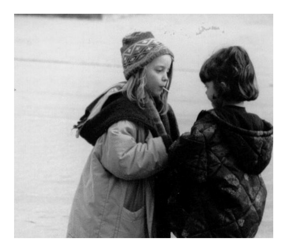
Figure 7.8: The emphasis on learner-centered learning and IT-based learning tools used on an individual basis, should not make us forget the important role of interaction as a motor and enhancer of learning processes.