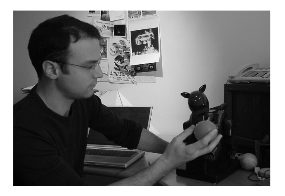
Figure 7.3: Our robot is an enhanced version of the commercially available AIBO. It is linked to an additional computer through a radio connection.

of capabilities which are necessary to establish the conditions for social interaction, such as the ability to look at an object as a way to draw attention of the speaker to the object.